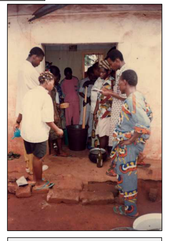
The group listened carefully to the instructions at every step.